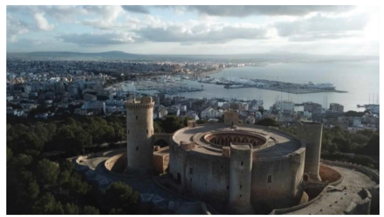
XUETA ISLAND (feature documentary) | <u>WORLD PREMIERE!</u> - Includes discussion with Producer / Narrator / Subject Dani Rotstein

Dani Rotstein, Felipe Wolokita and Ofer Laszewicki / Spain, USA Spanish, English (with English subtitles) 63 minutes