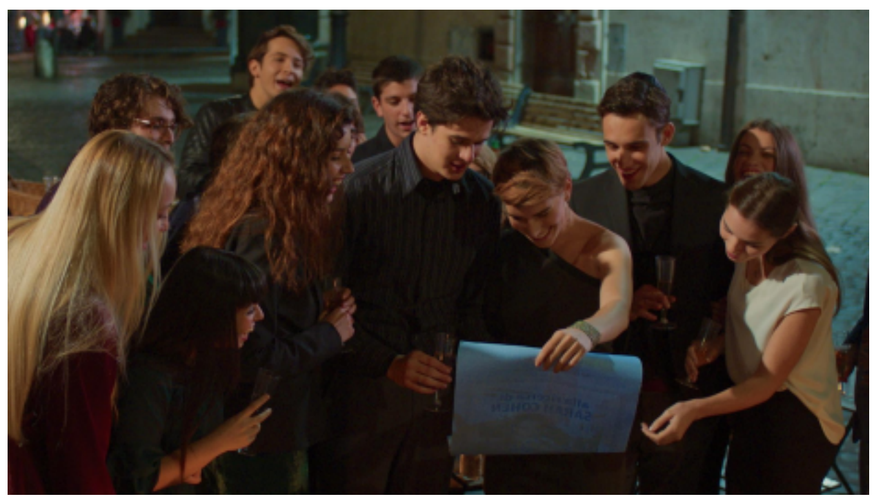
A STARRY SKY ABOVE THE ROMAN GHETTO (feature film) - Includes discussion TBD

Giulio Base / Italy Italian (with English subtitles) 100 minutes